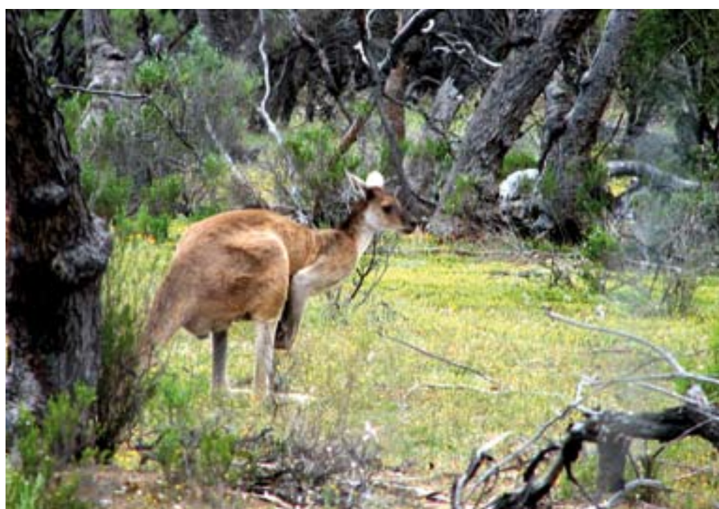
Figure 2 Yonga – grey kangaroo