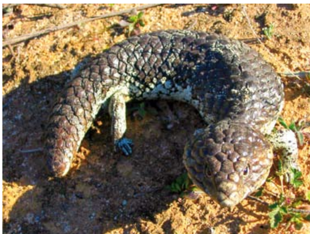
Figure 3 Yoran – blue tongue lizard