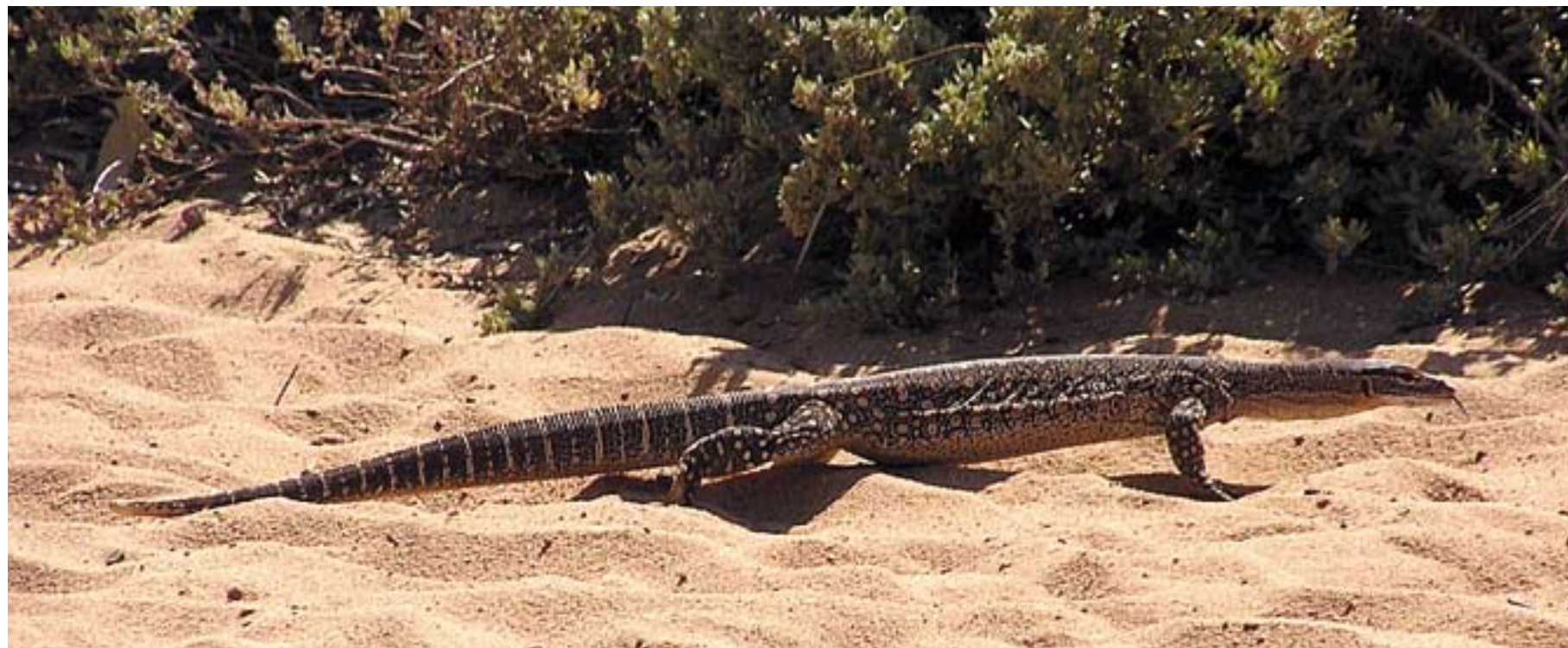
Figure 7 Karda – Goanna