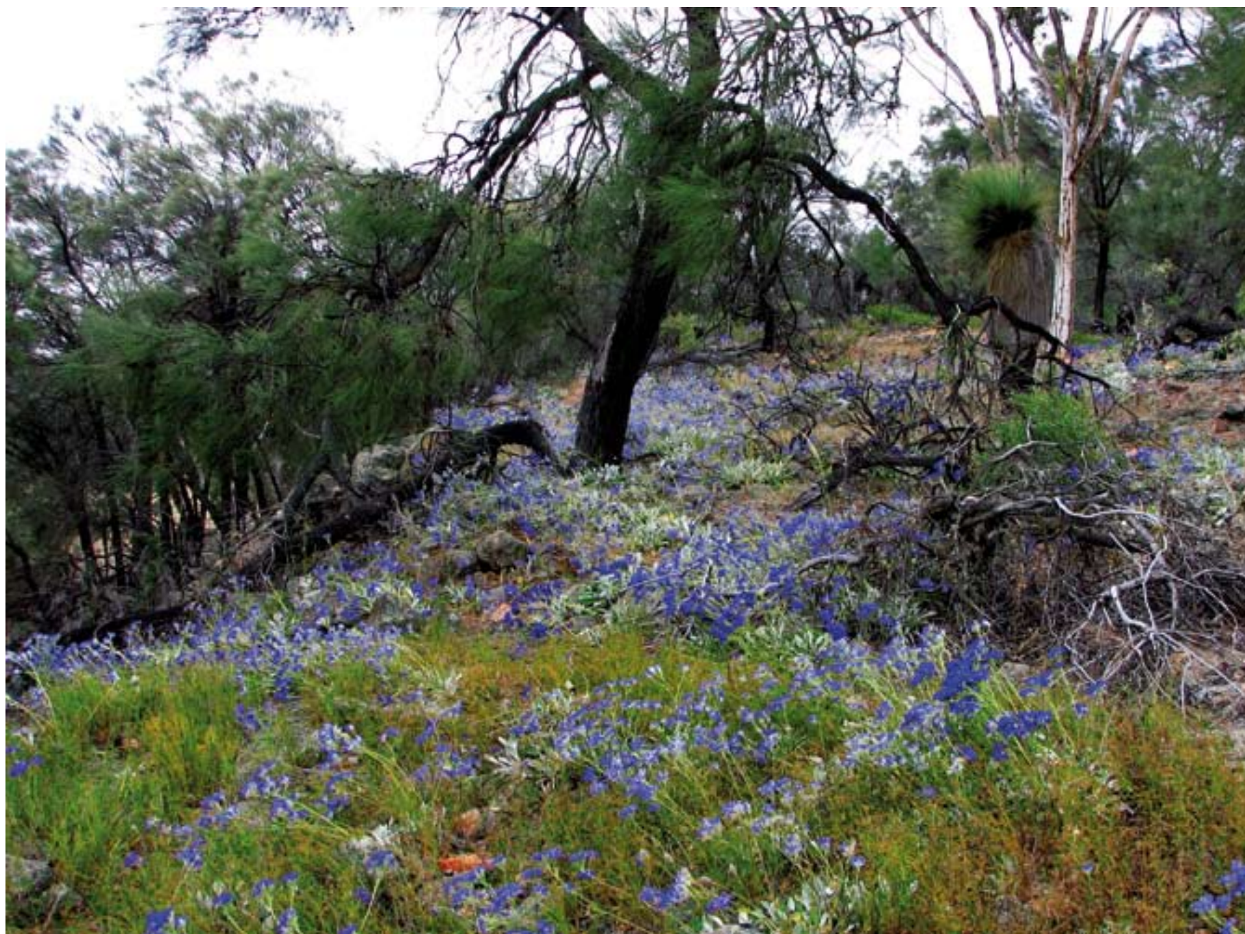
Figure 4 Kamarong – Spring in Ballardong