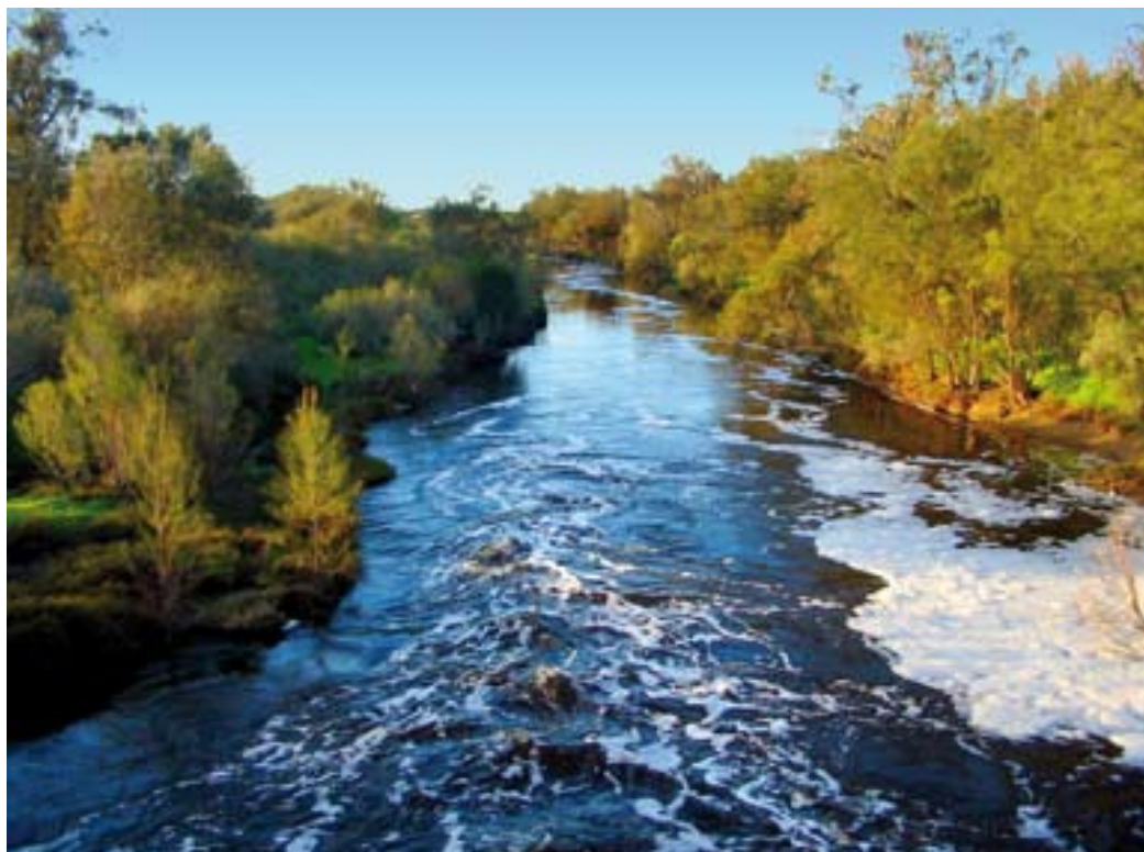
Gogulgar Bilya – Avon River

the ACC and further developments (ie MATS etc) will be progressed: