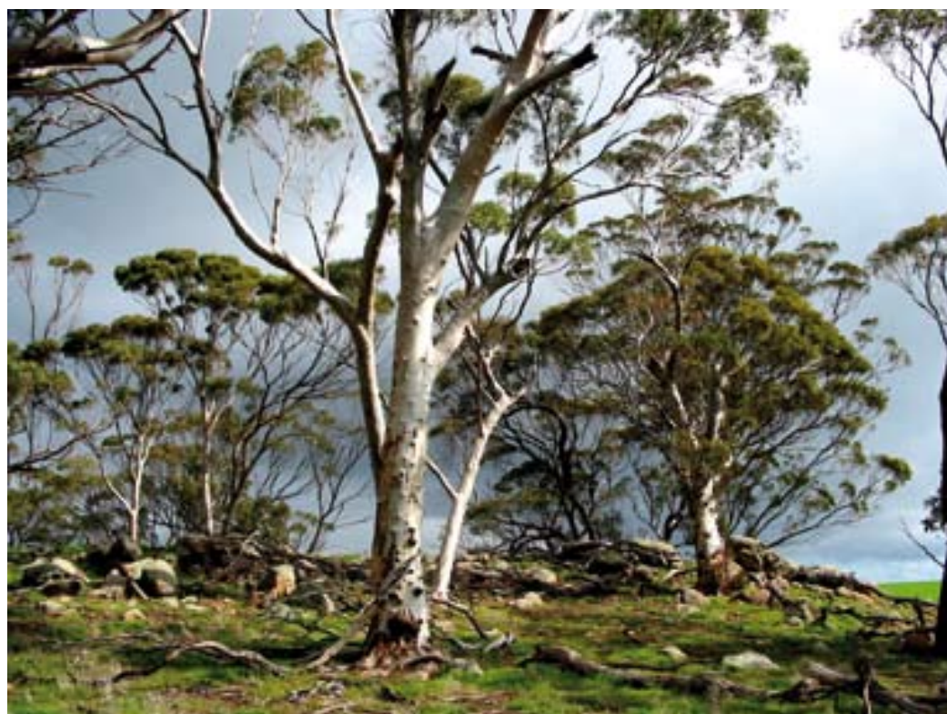
Figure 1 Wornt – white gum trees

Health of Country means growing a variety of trees, abundant wildlife, return of native animals and plants, restoring waterways and landscapes, and people interacting with and enjoying the natural environment.