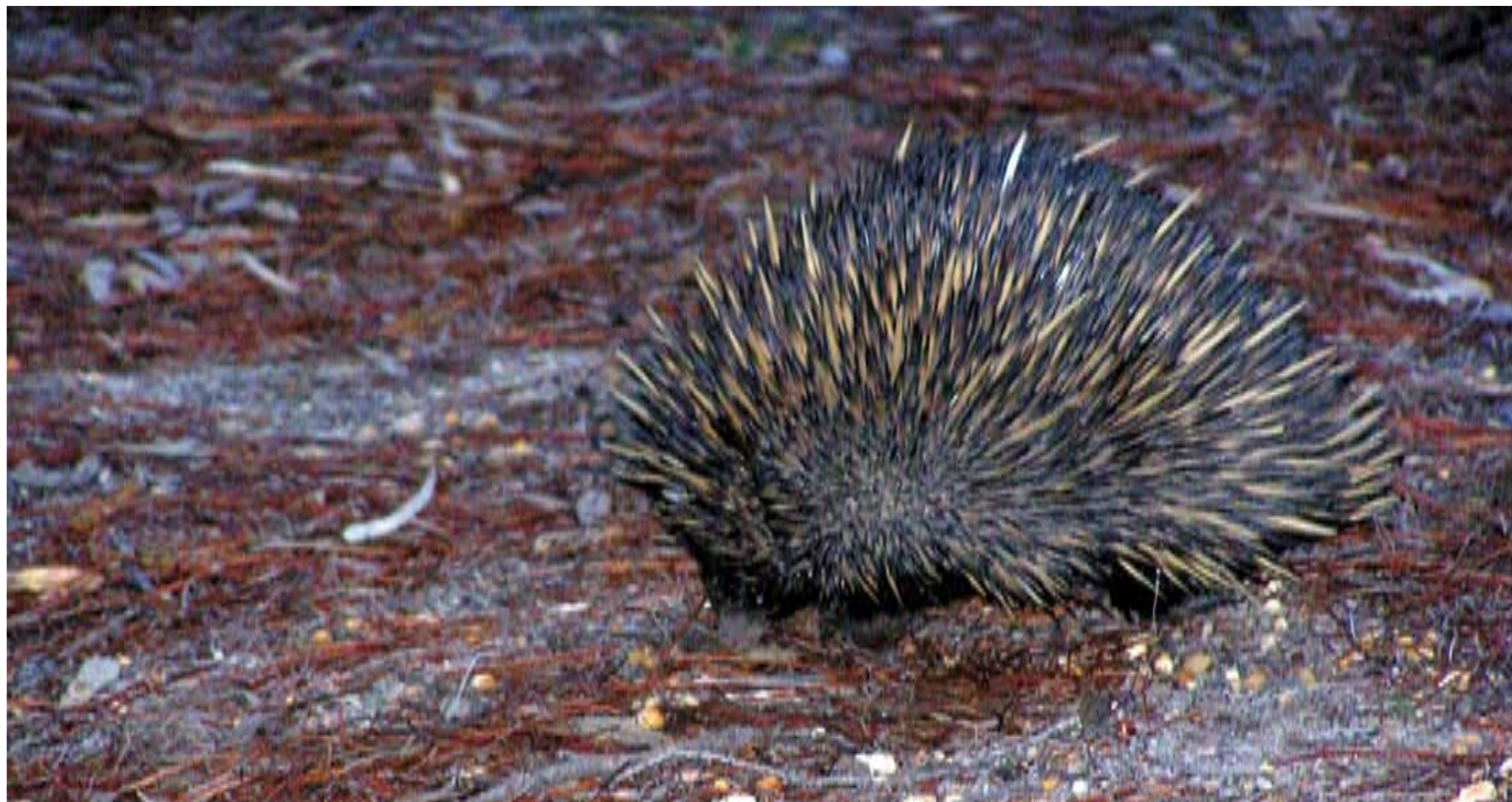
Figure 8 Nyingarn – Echidna