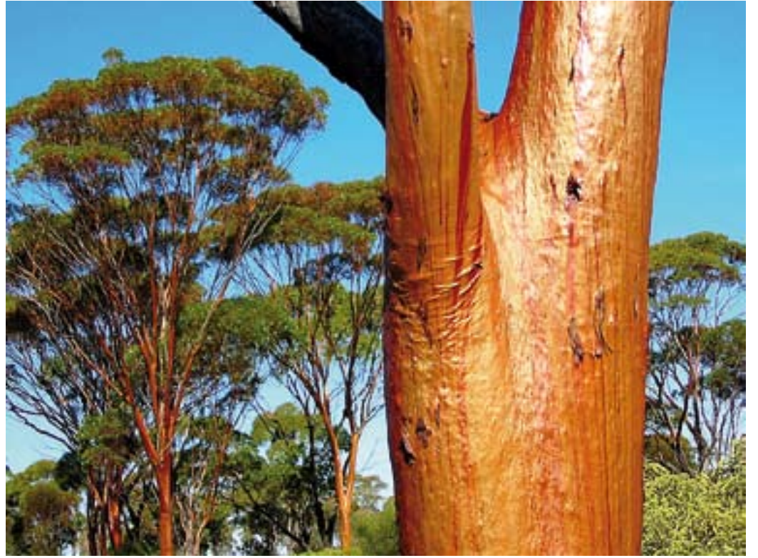
Figure 5 Djaawit – York Gum