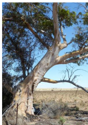
Salt salmon gum

The Eucalypt Woodlands are found on the flatter landscapes and lower rises of the wheatbelt (landscapes 1-4 in the diagram). The main trees are eucalypts that typically have a single trunk. They occur as a complex mosaic involving about 30 species, including many iconic trees of the Wheatbelt shown or named here. The trees present varies from patch to patch. The native understorey is diverse and very variable, ranging from largely bare to grassy to herbs and wildflowers to shrubby.