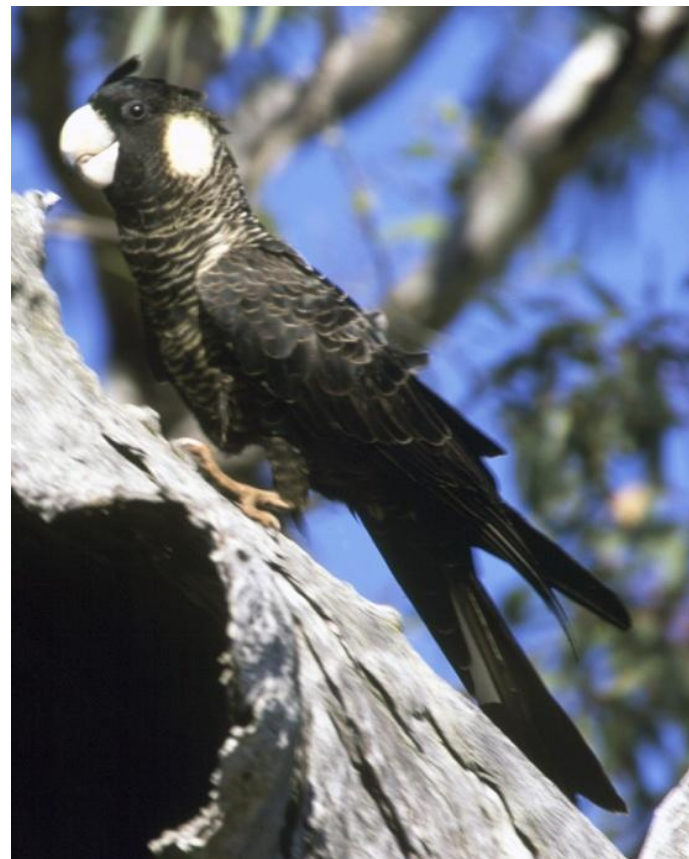
Carnaby's black cockatoo.

4. Remaining woodlands provide vital habitat for many unique plants and animals. They include some that are now threatened, such as Carnaby's Black Cockatoo and the numbat.