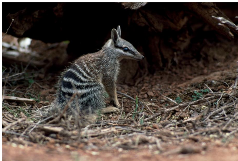
Numbat.

contact your local council or WA Depts of Environmental Regulation or Parks and Wildlife about any local or state clearing laws that may apply.